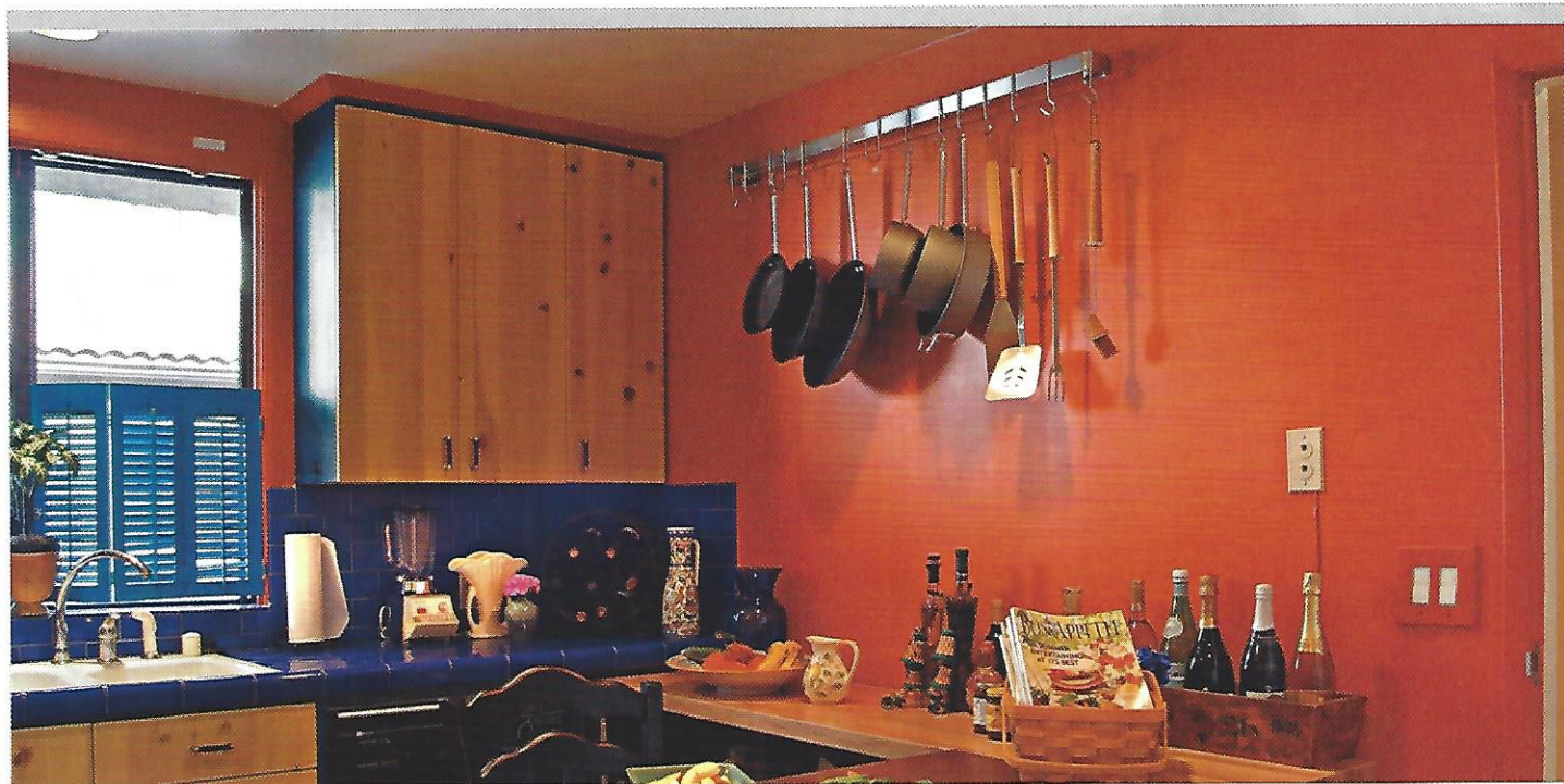
Finding the L-shaped, combination eating, work and storage space piece made all the difference in the remodel of this space-challenged kitchen. This project was conceived for a client who lived in a condominium in the Beverlywood area. She had a limited budget, but she wanted to preserve the tile.

Nothing makes it feel more like a fresh start than a remodel. This year could be the year you do that renovation project you put off last year, and the year before that.