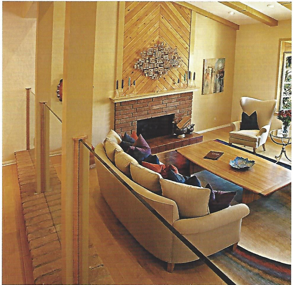
Simplification was the guiding principal behind the remodel of this Bell Canyon livingroom, which benefited greatly by the addition of a glass safety railing/room divider.

To view some design ideas, go to our website: JanaDesignInteriors.com .